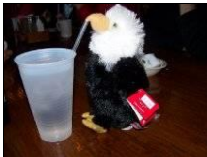
Reprint from 2012 Eagle Watch Trip

Eagle facts: Eagles lay between one and three eggs per season. Usually only one or two hatch. Parents only take care of the eagles for one year, and then they are on their own. They do not start reproducing until they are five years old. They develop white feathers on their heads at this stage also. Eagles can live to be twenty-five years old. They sit on broken patches of river ice and watch for fish to catch. They not only eat fish, but they also hunt ducks and other birds.