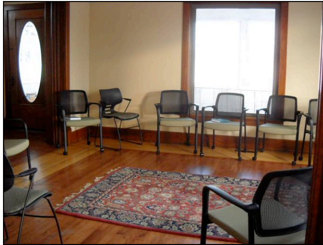
Meeting room at Clear Creek

discussing upcoming peace projects (see "Upcoming Events" above for information on the event at Bradley University.)