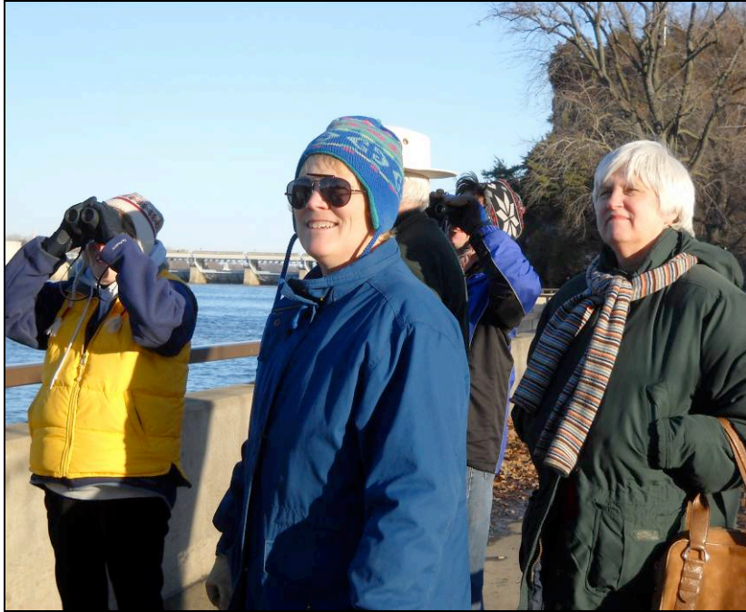
Friendly eagle watchers at Illinois Waterways Visitor Center across the Illinois River from Starved Rock State Park

Oak Park Friends Meeting – Religious Society of Friends 720 Chicago Avenue, Oak Park, Illinois 60303 708-445-8201